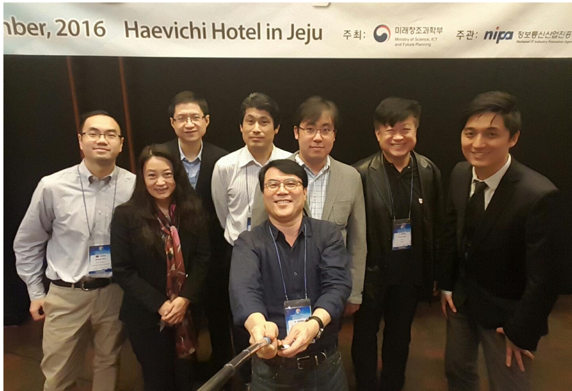
WG2 members in Naha, 2012